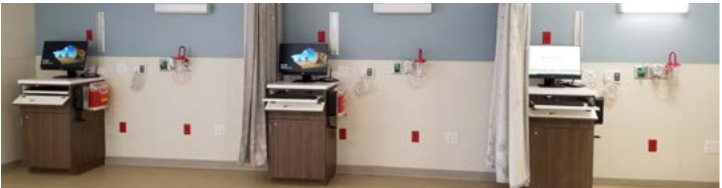
Surgical Center Equipment Procurement and Set-up